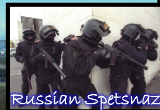
Russian Spetsnaz "Cowboy"