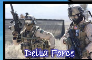
Delta Force "Cowboy"