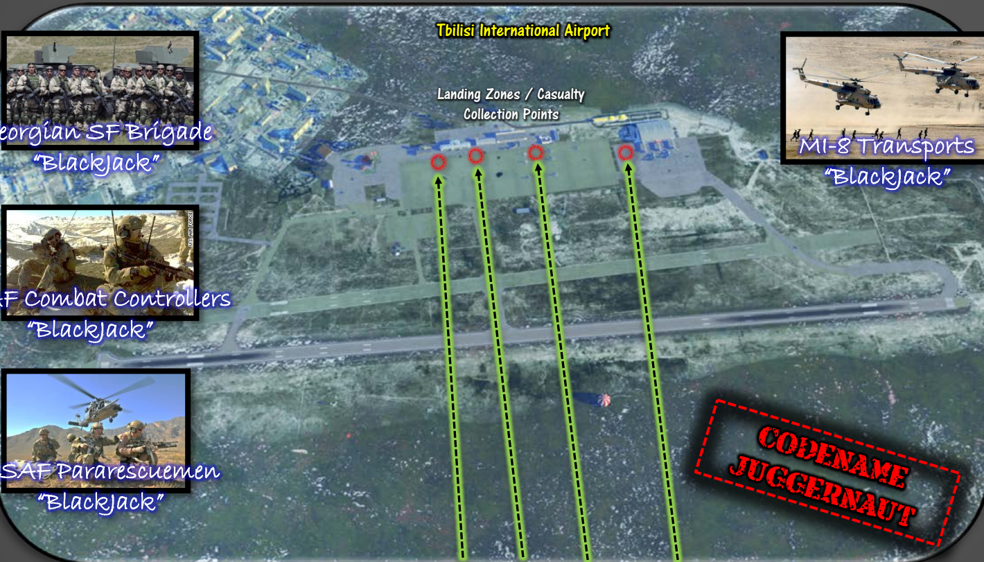
Georgian SF Brigade "BlackJack"