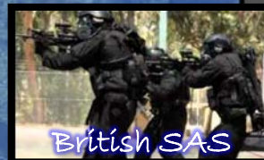
British SAS "Lonestar"