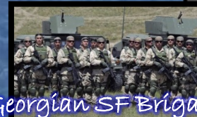
Georgian SF Brigade "Lonestar"