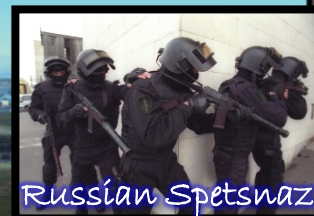
Russian Spetsnaz "Cowboy"