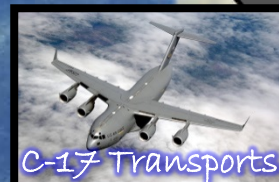
C-17 Transports "Blade 1-2 & 1-3"